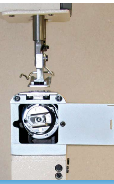
Machine is equipped with extra large diameter of hook.